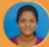
Suwaatha S IV/ICE